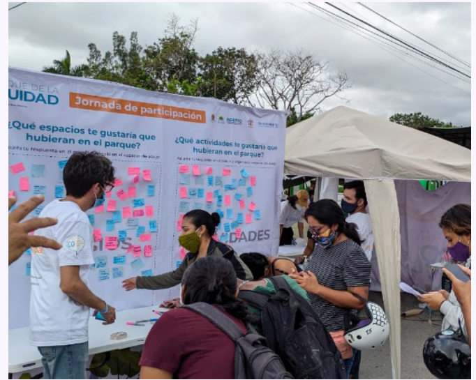
Participatory activities for the planning and design of the Parque de la Equidad.